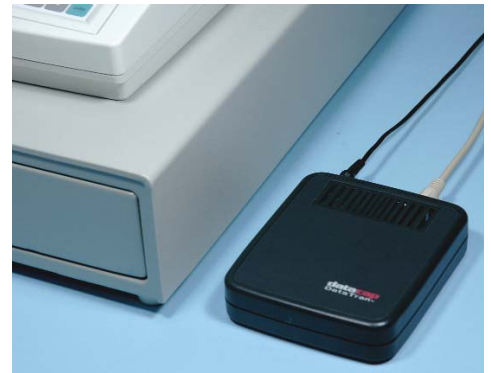
DataTran™ Integrated Electronic Payment Option