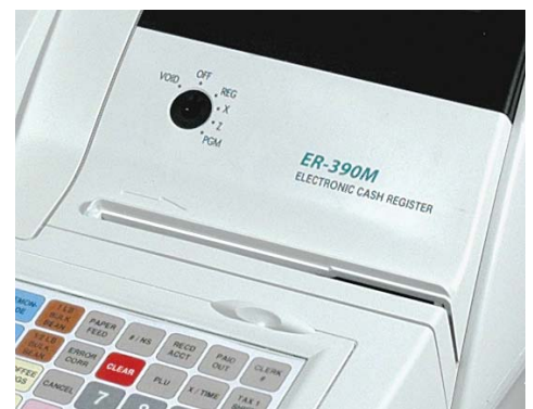
Internal Magnetic Card Reader Option