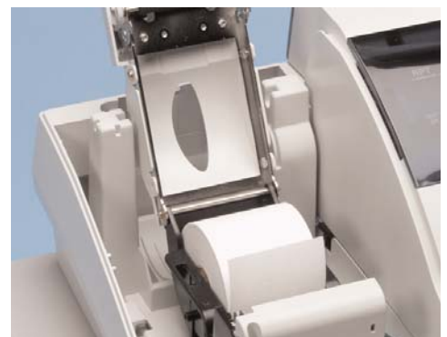
Quick and Easy Drop-In Paper Loading